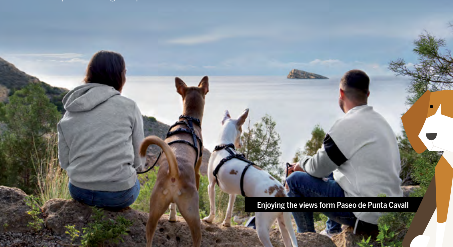
Enjoying the views form Paseo de Punta Cavall

3 WALKS, 3 UNIQUE EXPERIENCES // Walking while sniffing and moving their hips proud... Our doggy's favourite activities! Here we highlight 3 walks that our furry friends will love: